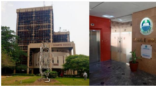
Plates 13a and b

Front view and Ground Floor Interior of the Senate House, Akinde Toyin Emmanuel, 2025