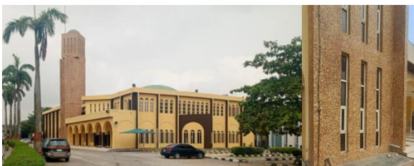
Plates 6a and b

The tower is a Crucifix or, better still, a Cross, the symbol of life, death, and resurrection of Christ Jesus, constructed with intersecting metal frames, giving a sense of architectonics, and clad with silver aluminum sheet. Directly behind the cross is a pyramid projectile, clad in translucent flex sheets numbering approximately forty-eight (48) on the roof. The surroundings of this edifice are paved in concrete and complemented with concrete pots, housing varying flower types. The church goes by the slogan "Welcome to the headquarters of heaven...", emblematic in their choice of colour white and its variance, which signifies purity, equity, empathy, and tranquility; beckoning worship to initiate faithful and non-initiates.