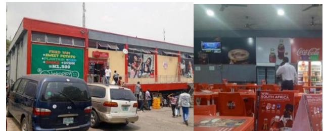
Plates 9a and b

The roof is suspended by rectangular pipes, two beams, and four pillars, painted in white emulsion. Its metal sheets and plastic flex are tinted green, yellow, and white. The name of the franchising company is crafted in lowercase "ap" and complemented with its logo, replicated on each side of the divide to give a logogrammatic impression.