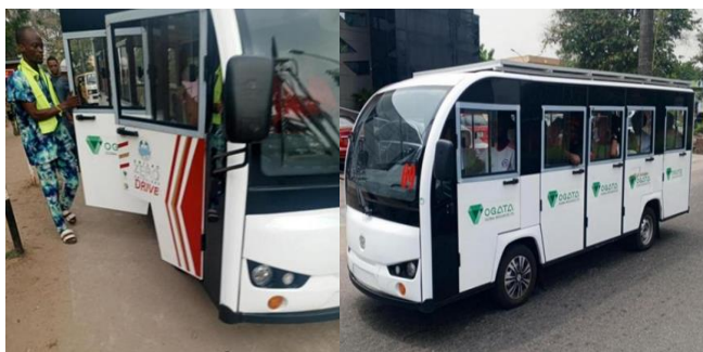
Plate 11a and b

The roof of the edifice is clad with solar panels to provide an uninterrupted power supply. Zenith Bank, Unilag Alumnae, and Office of Advancement were crested with white and gold flex plastic, complemented with the logo of the trio at the base of the first floor of the building. Additionally, the sleek and reflective surface of the glass adds a sense of sophistication and modernity to the bank's facade. Also evident on the building's front facade is a digital LED board, which often displays products relevant to the building. Beyond aesthetic merits, the glass cladding provides thermal insulation, helping regulate indoor temperatures and contributing to energy efficiency.