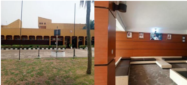
Plate 16a and b

One such event is Peju Layiwale's Indigo Reimagined exhibition, published by the Textile Museum Journal in 2021. The project is well appreciated when viewed from the angles, significantly the right side angle of the building.